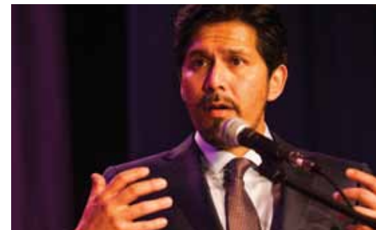
State Senator Kevin De León was honored as Civic Leader of the Year.