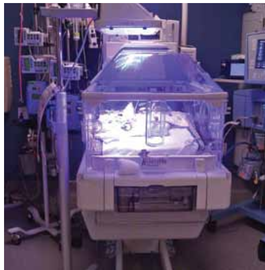
The Giraffe bed was purchased with funds donated by White Memorial employees during the annual Employee Giving Campaign.

Donations totaling more than $151,000 benefited multiple initiatives at WMMC: the Dupper Fund for community outreach, the Employee Assistance Fund Donation and Loan program,